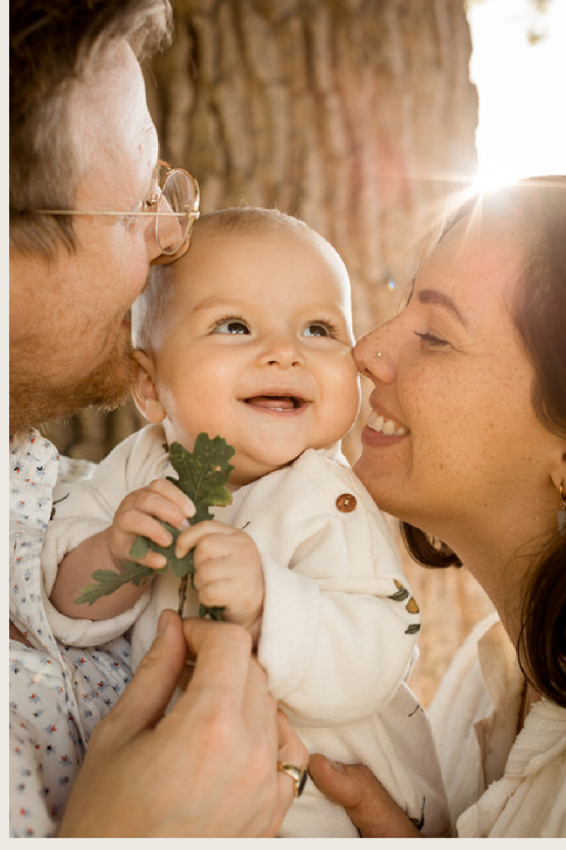
Or on Location